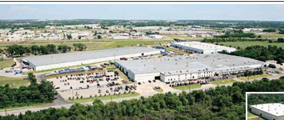
Ameristar's world headquarters, manufacturing & coil processing facilities in Tulsa, Oklahoma, USA.